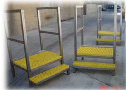
Operator Safety Decks