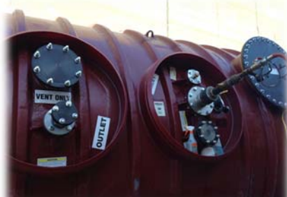
Underground Briner Being Pressure Tested