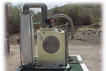
30 Mini-Briners for Remote Well Sites